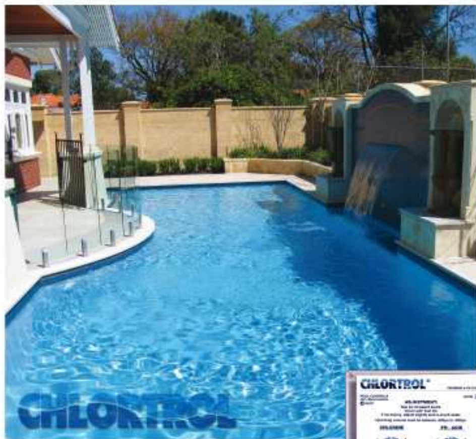
CA2 - Standard Controller