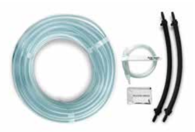
Dual Pump Commercial Tubing Maintenance Kit