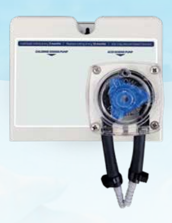
Pool Controls SWC & XLS pH Upgrade Kit Product Code - 00122019

This helps maintain perfect water chemistry and optimises the effectiveness of the chlorine sanitiser.