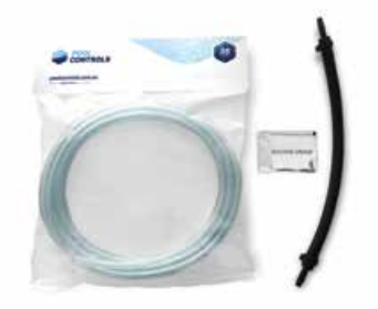
Single Pump Tubing Maintenance Kit

Choose from the Single Pump, Dual Pump and Commercial Tubing Maintenance Kits depending on your installation. Each Kit contains replacement squeeze tube (or tubes), sachet of silicone grease, 6m roll of feed tubing and for dual pump kits, a pre-assembled gas loop with connectors.