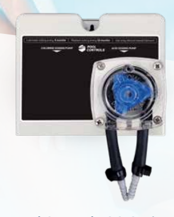
Pool Controls SG Series pH Upgrade Kit Product Code - 00122016

The Pool Controls Upgrade Kits use a sophisticated inbuilt algorithm developed by Pool Controls to calculate how much acid is required to adjust the pH of the swimming pool water.