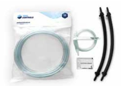
Dual Pump Tubing Maintenance Kit