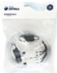
Double Valve Replacement Kit