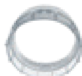
Cell Housing Nut