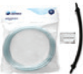
Single Pump Tubing Maintenance Kit

Choose from the Single Pump, Dual Pump and Commercial Tubing Maintenance Kits depending on your installation. Each Kit contains replacement squeeze tube (or tubes), sachet of silicone grease, 6m roll of feed tubing and for dual pump kits, a pre-assembled gas loop with connectors.