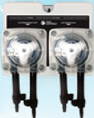
D10 Dual Pump 60RPM Product Code - 09061064