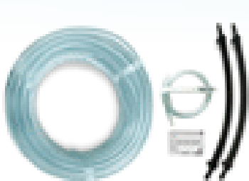
Dual Pump Commercial Tubing Maintenance Kit