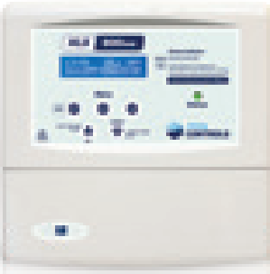
XLS Replacement POWER SUPPLY ONLY