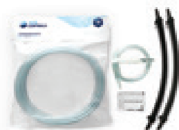
Dual Pump Tubing Maintenance Kit