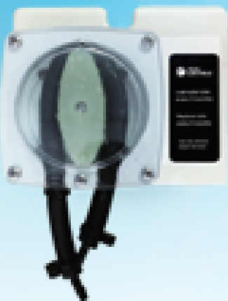
D1500 Peristaltic Pump Flow rate of 1500mL per minute. Product Code - 09061067