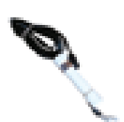
Multi-Electrode Assembly for Tapping Band with 3m cable