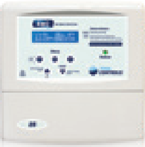
SWC Replacement POWER SUPPLY ONLY

All Power Supply units have been designed to operate in full sun and our tough Australian weather and Pool Controls anticipates that you will enjoy many years of trouble-free pool water management from your investment. However, like all equipment your machine will look better and last longer if it is well-maintained and operated in accordance with the instruction manual provided. Instruction manuals are also available to download from www.poolcontrols.com.au