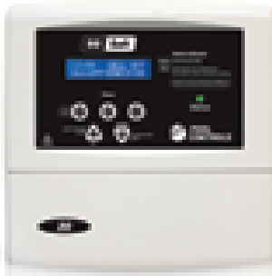
SG Series Replacement POWER SUPPLY ONLY